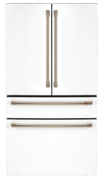
CGE29DP4TW2 Matte White with Brushed Bronze handles