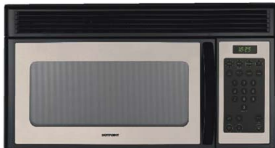
(Previous Model) Model RVM1625SJ