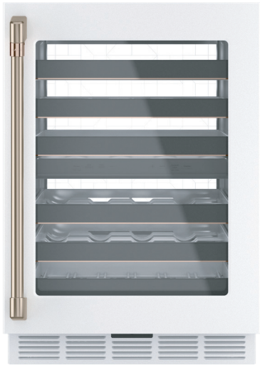
CCP06DP4PW2 Matte White with Brushed Bronze handles