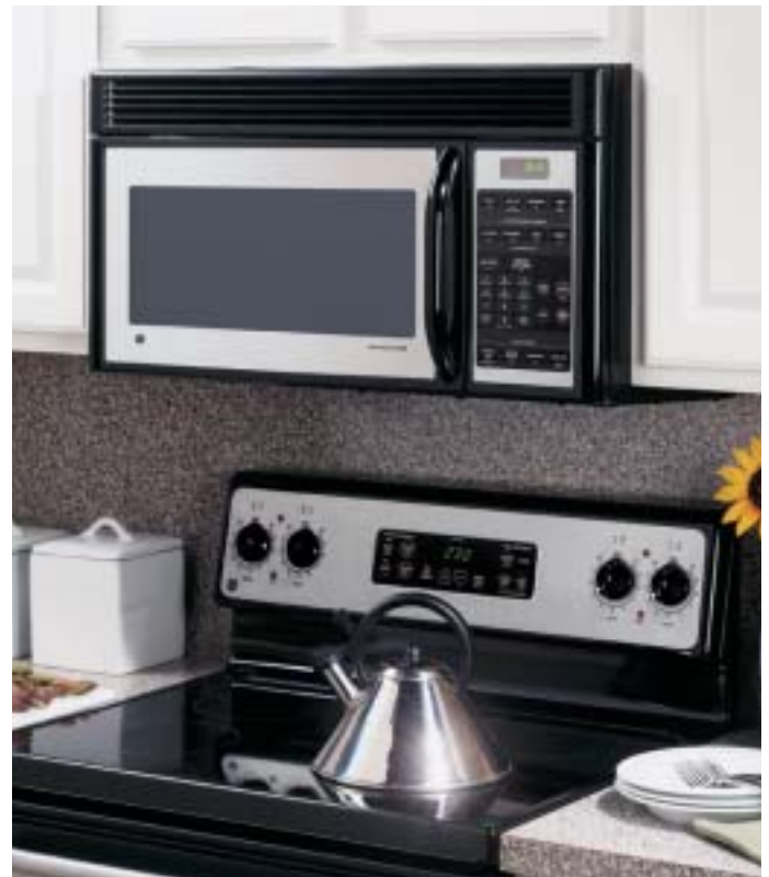
JWM1640SJ shown with JBP66SHSS