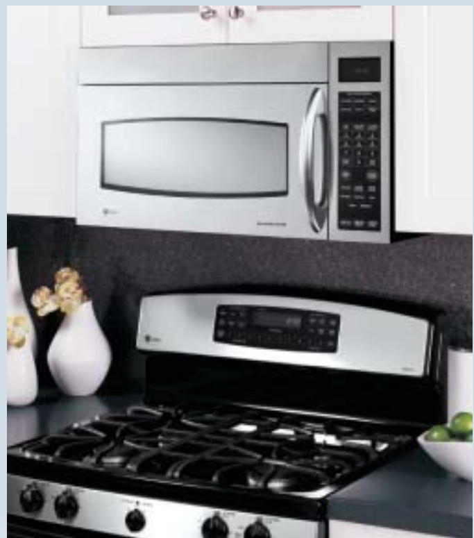
JVM1870SF shown with J2B915SEHSS