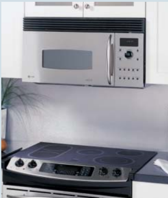
SCA2001FSS shown with JS968SFSS