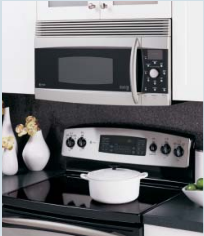
SCA1001SH shown with JBP968SHSS