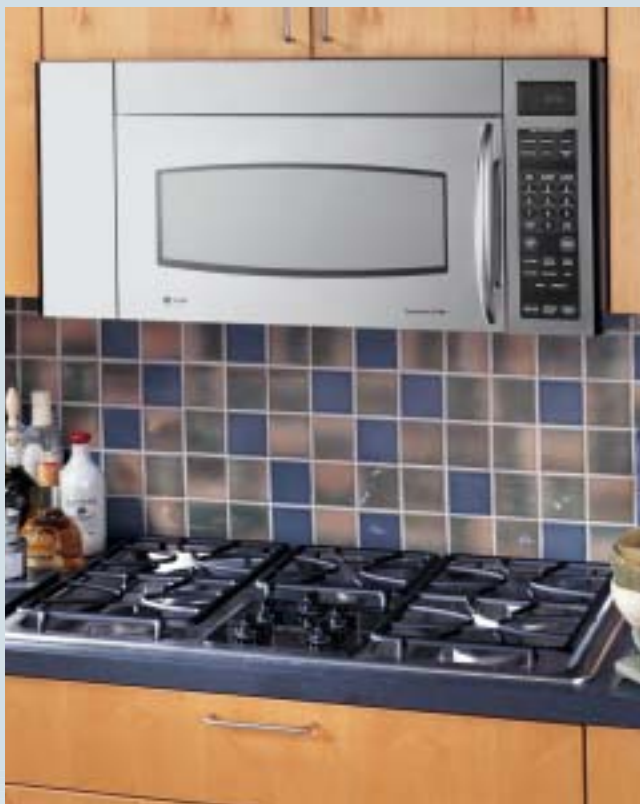
JVM3670SF shown with JGP963SECSS