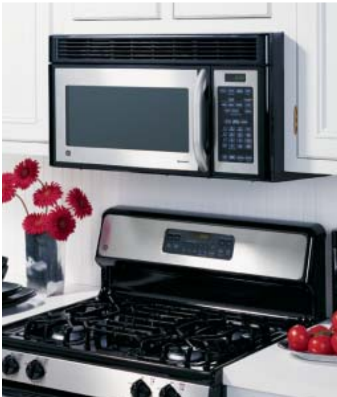
JWM1650SH shown with JGBP85SHSS