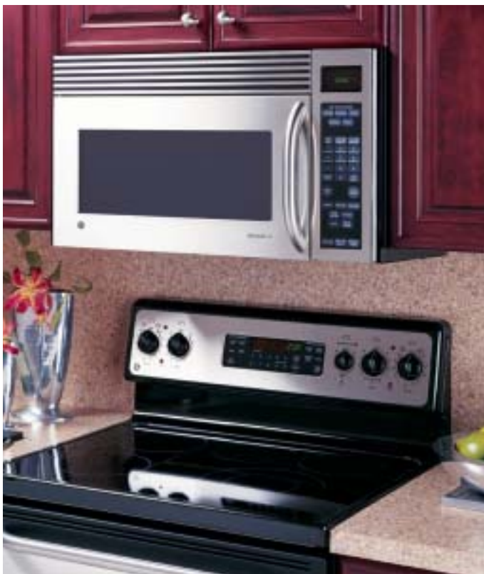
JVM2050SJ shown with JBP84SHSS