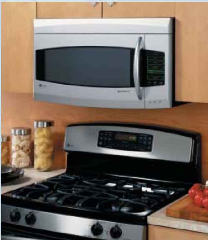
JVM2070SH shown with JGB915SEFSS