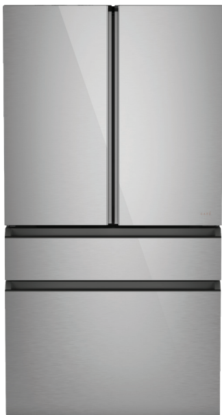
CGE29DM5TS5 Platinum Glass with Integrated Pockets