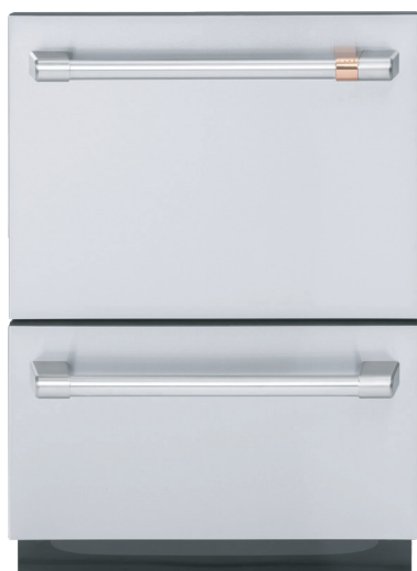
CDD420P2TS1 Stainless Steel with Brushed Stainless handle