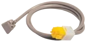
RAK3152/3202/3302 230/208-volt cord connection kit

265/277-volt units and line cord kits available by special order