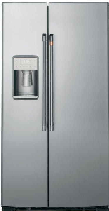
CZS22MP2NS1 Stainless Steel with Brushed Stainless handles