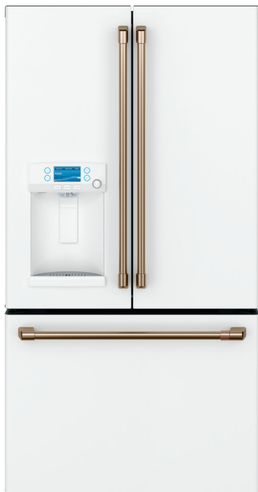
CFE28TP4MW2 Matte White with Brushed Bronze handles