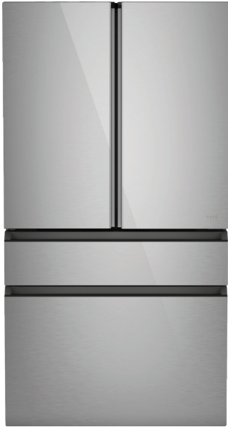
CGE29DM5TS5 Platinum Glass with Integrated Pockets