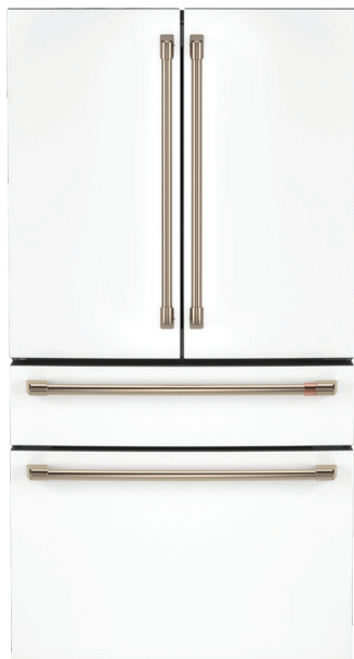
CGE29DP4TW2 Matte White with Brushed Bronze handles