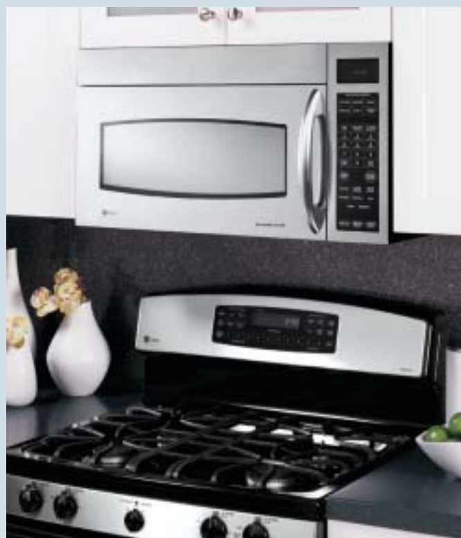
JVM1870SF shown with J2B915SEHSS