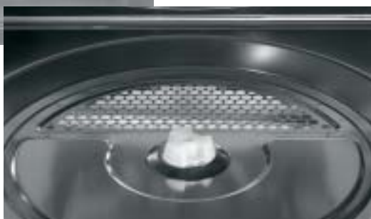
Lower Halogen Lamps