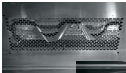
Upper Halogen Lamps