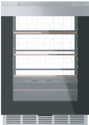
CCR06BM2PS5 Platinum Glass finish