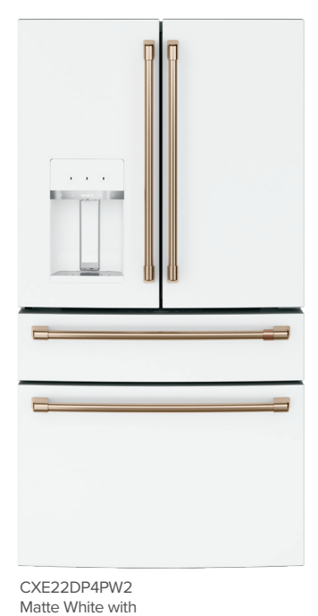
ALSO AVAILABLE IN

CXE22DP2PS1 Stainless Steel with Brushed Stainless handles