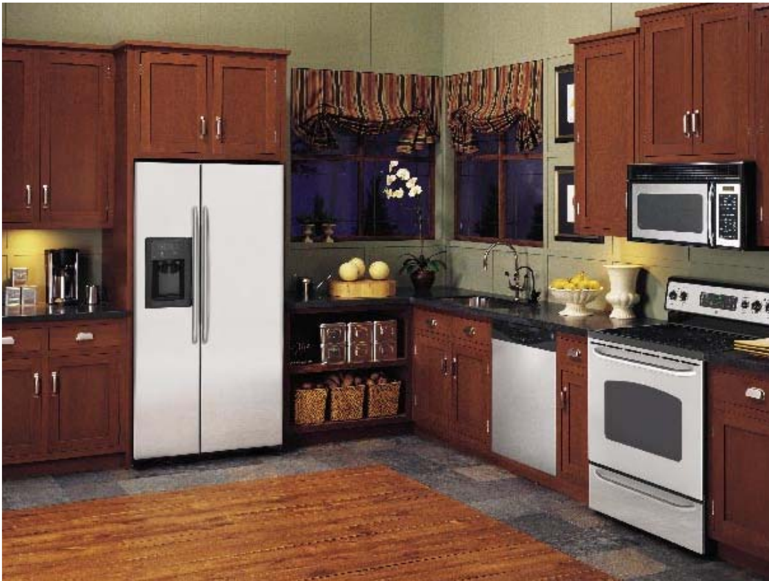
Photo includes models: JBP72SKSS, JVM1650SH, GLD4260LSS, GSS25WSSSS

available in white, black, bisque and stainless steel