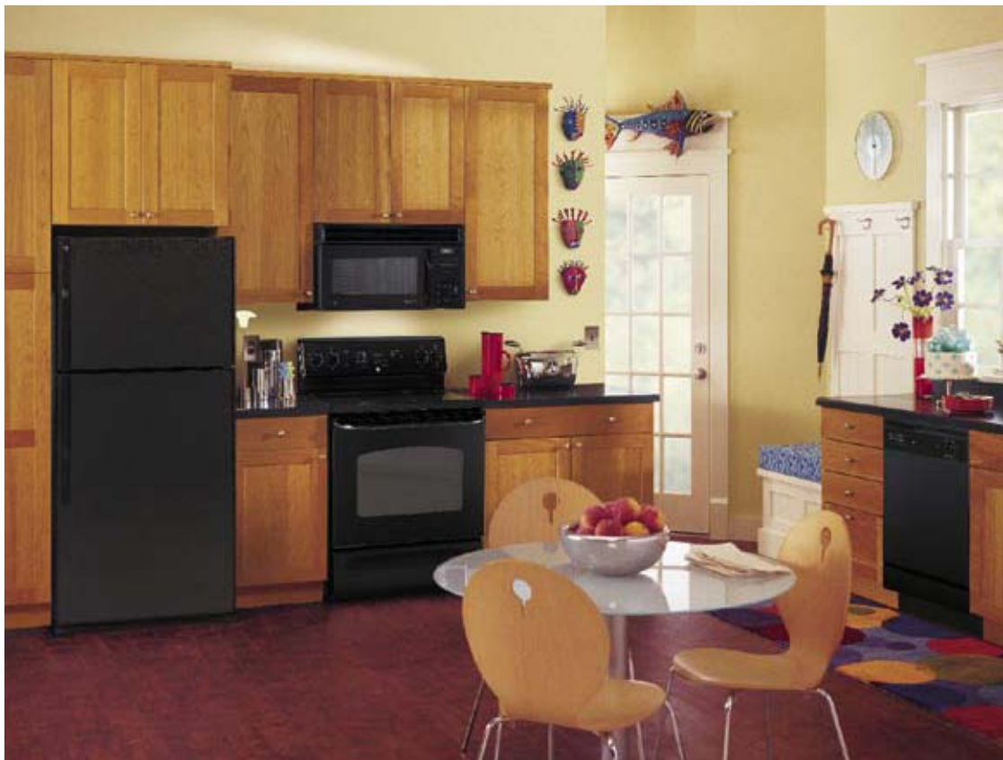
Photo includes models: JBS55BKBB, JVM1440BH, GSD3200JBB, GTS22WCPBB