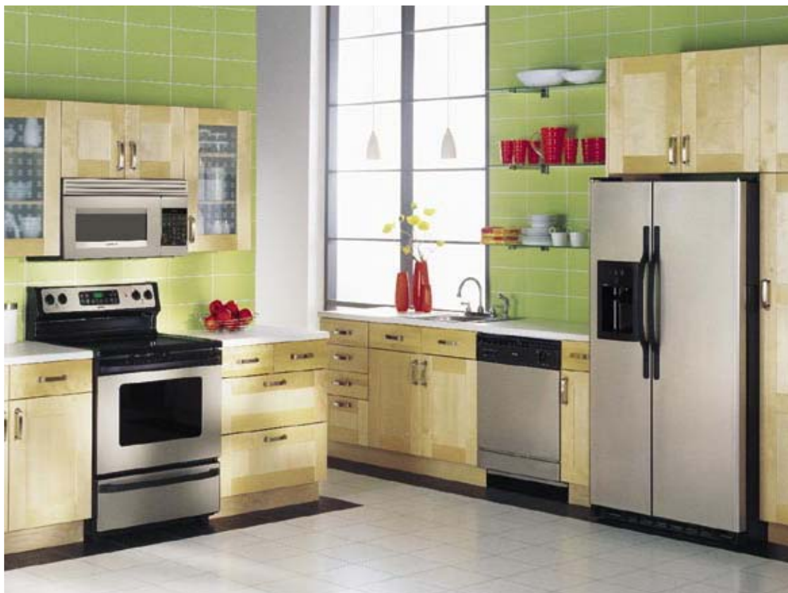
Photo includes models: RB790SHSA, RVM1435SK, HDA3440GSA, HSM25GFRSA

available in white, black, bisque and silver metallic