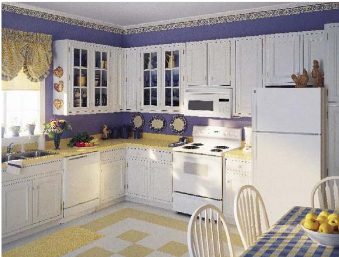
Photo includes models: RB526HWW, RVM1435WK, HDA2000GWW, HTS17BBSWW