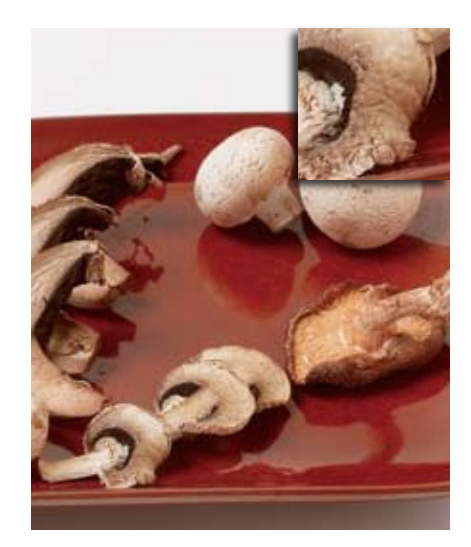
Mushrooms—Day 5 Conventional system Mushrooms are shriveling, shrinking and falling apart.