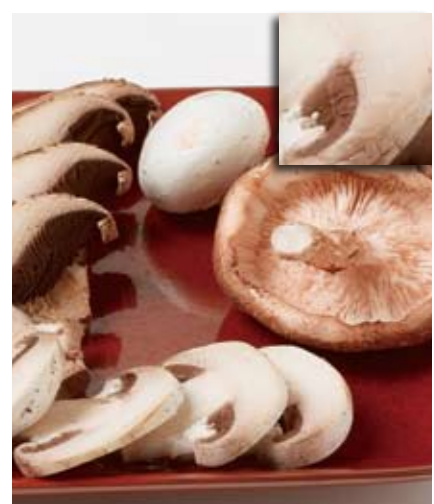
Mushrooms—Day 5 ClimateKeeper2 system Still fresh and firm, mushrooms remain smooth and meaty.