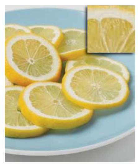
Lemons—Day 5 ClimateKeeper2 system Still fresh and juicy, slices stay bright and moist.