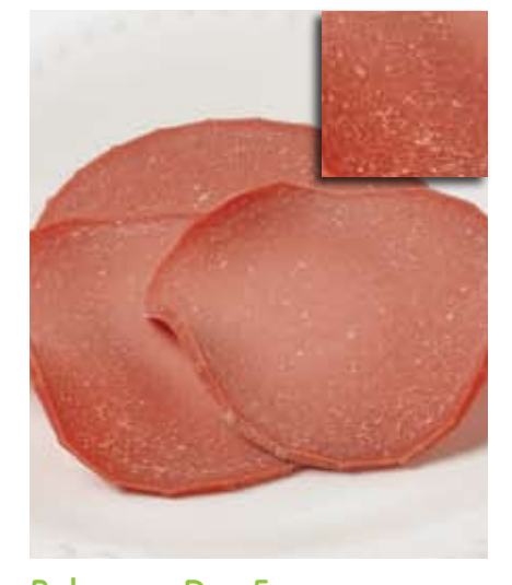
Bologna—Day 5 Conventional system Slices start to look and feel leathery and are curled at the edges.