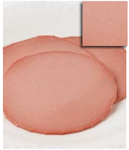
Bologna—Day 5 ClimateKeeper2 system Slices remain moist, smooth and uniform in color.