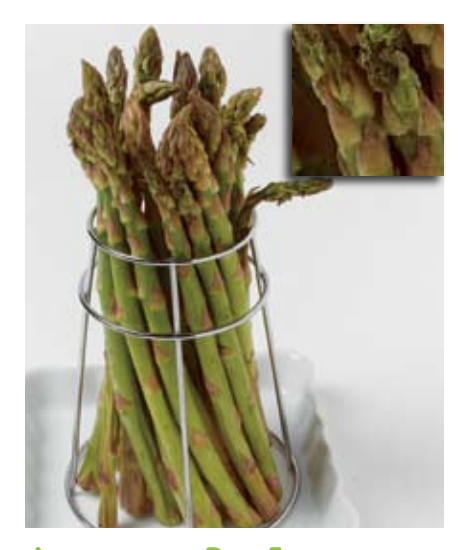
Asparagus—Day 5 Conventional system Stalks have begun to bend and tips are no longer firm and crisp.