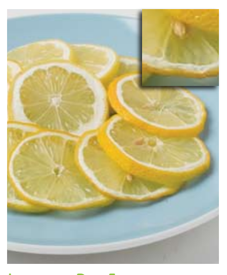
Lemons—Day 5 Conventional system Fruit pulp is losing moisture and rinds are shriveling.