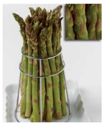
Asparagus—Day 5 ClimateKeeper2™ system Fresh-looking in texture and color, the bright-green stalks stand straight.