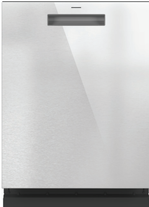
CDP888M5VS5 Modern Glass