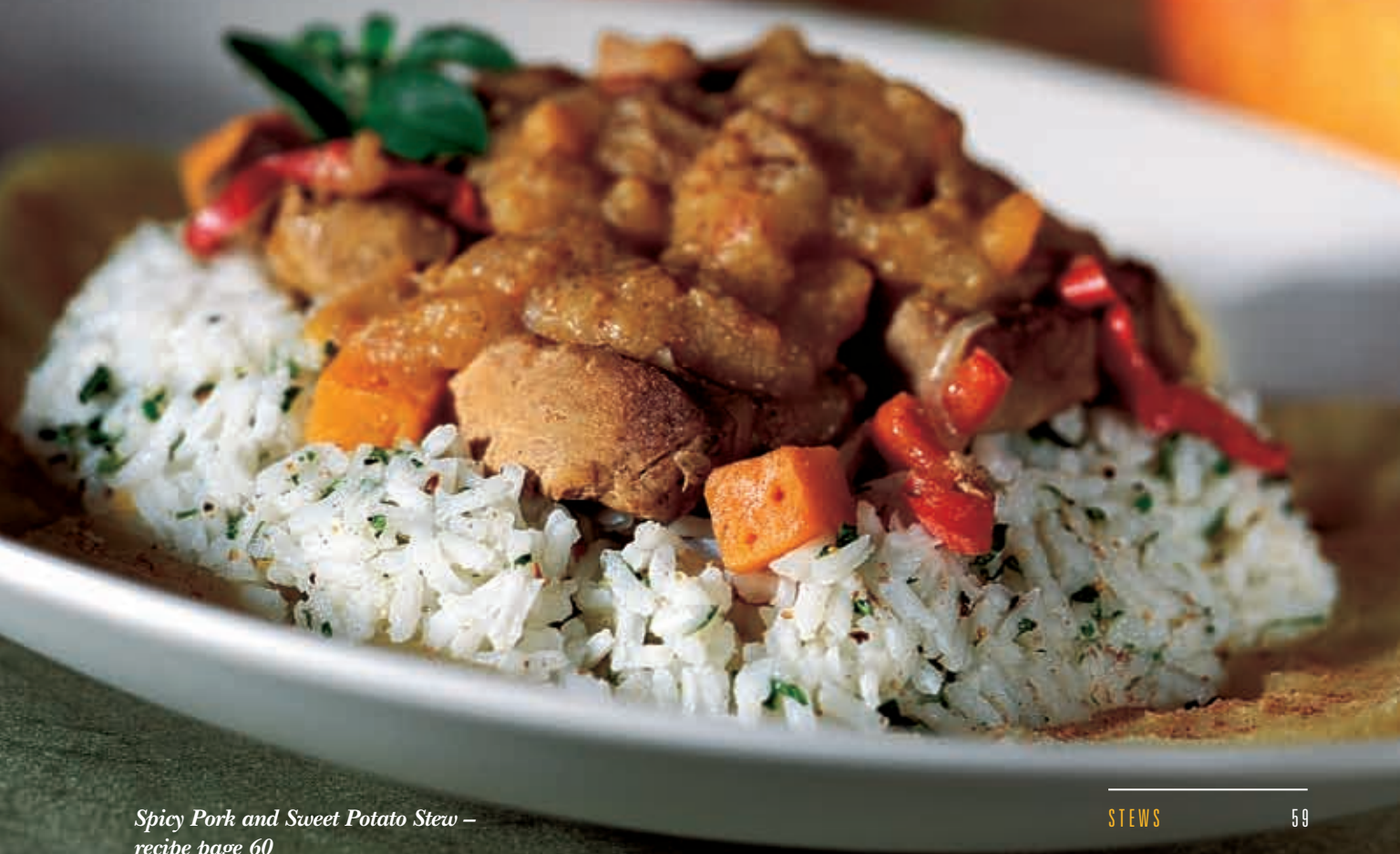
Spicy Pork and Sweet Potato Stew – recipe page 60