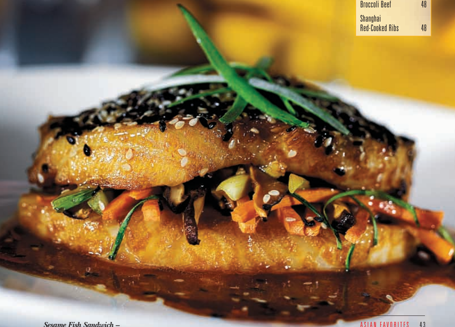
Sesame Fish Sandwich – recipe on page 44